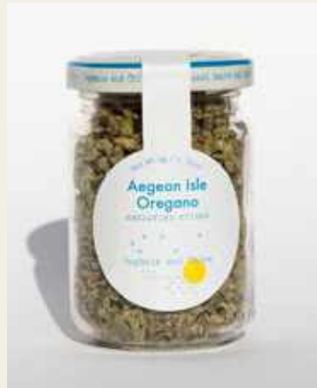
Aegean Isle Oregano ORE21-GJ