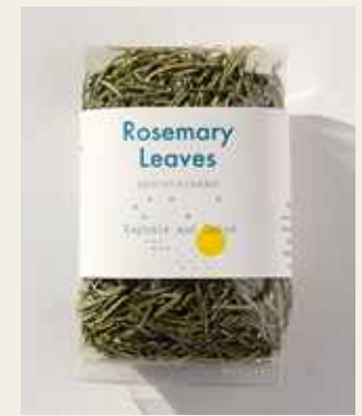
Rosemary Leaves ROS20-PB