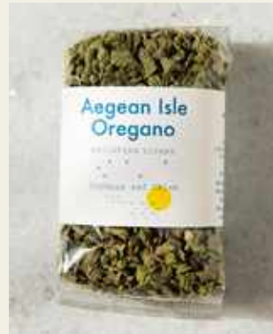
Aegean Isle Oregano ORE21-PB