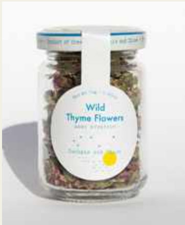
Wild Thyme Flowers THY20-GJ