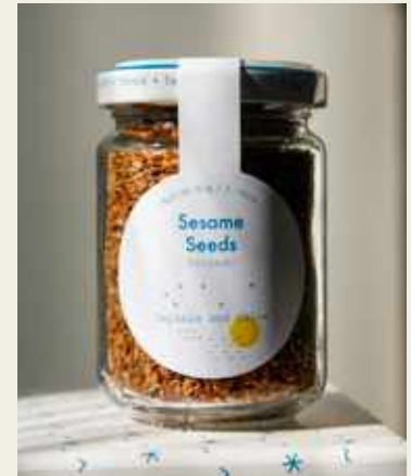
Sesame Seeds SES20-GJ