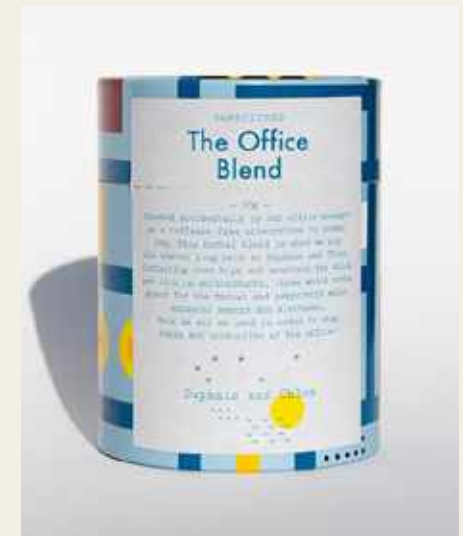
The Office Blend BLE20-PC