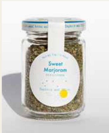
Sweet Marjoram ORE22-GJ