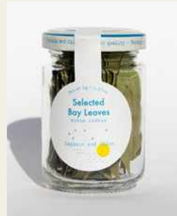
Selected Bay Leaves LEA20-GJ