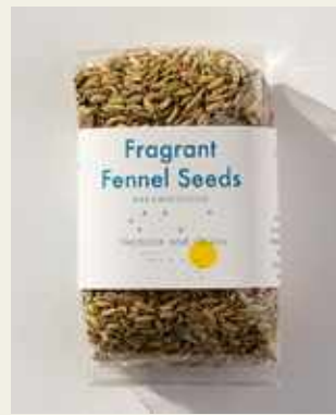
Fragrant Fennel Seeds FEN20-PB