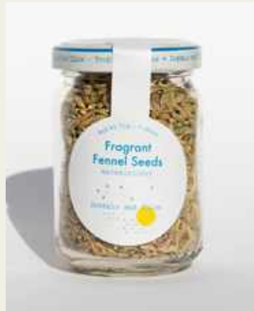
Fragrant Fennel Seeds FEN20-GJ