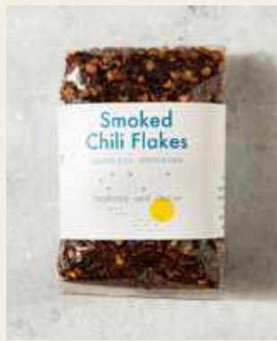
Smoked Chilli Flakes FLA20-PB