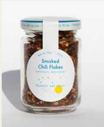
Smoked Chilli Flakes FLA20-GJ