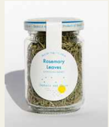
Rosemary Leaves ROS20-GJ