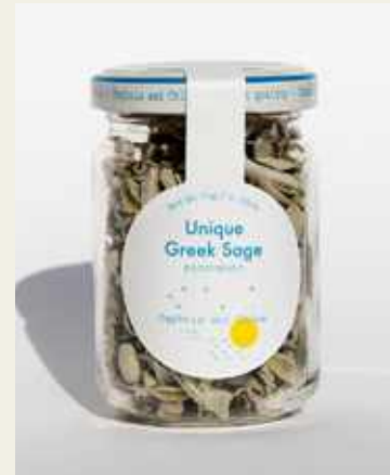
Unique Greek Sage SAG20-GJ