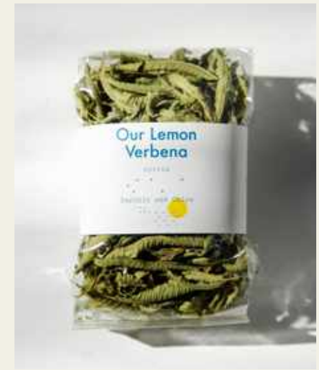
Our Lemon Verbena VER20-PB