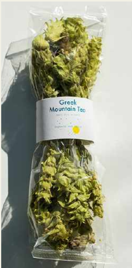
Mountain Tea Bouquet TEA20-BQ