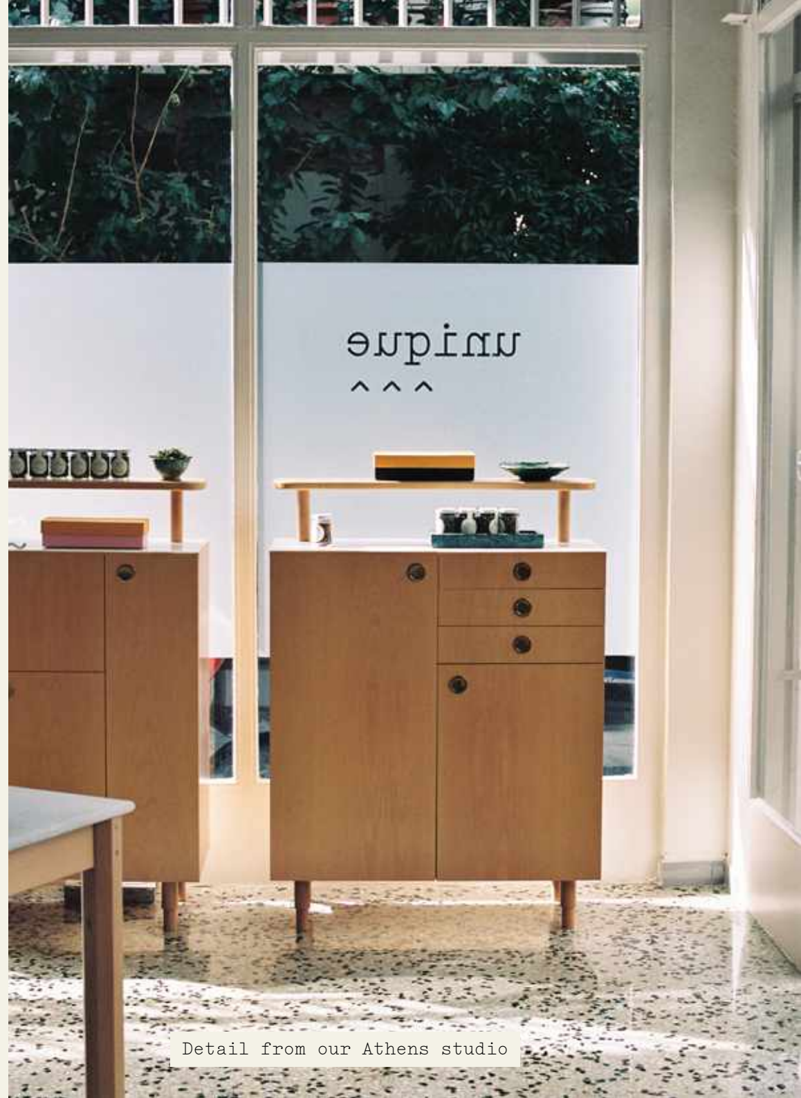
Detail from our Athens studio