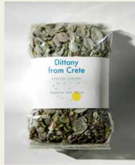
Dittany from Crete DIT20-PB