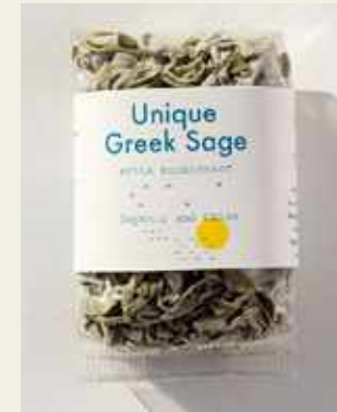
Unique Greek Sage SAG20-PB