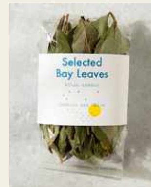
Selected Bay Leaves LEA20-PB