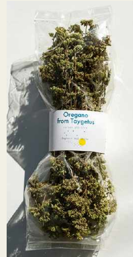
Oregano Taygetus Bouquet ORE20-BQ