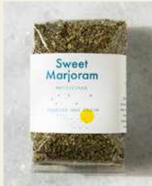
Sweet Marjoram ORE22-PB