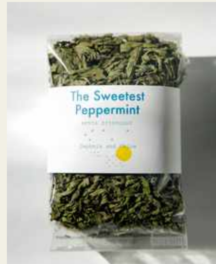
The Sweetest Peppermint MIN20-PB