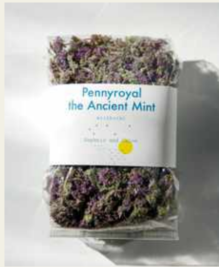
Pennyroyal the Ancient Mint MIN21-PB