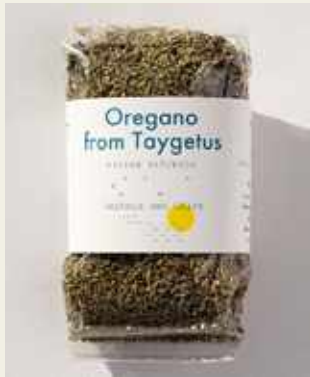
Oregano from Taygetus ORE20-PB