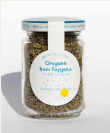
Oregano from Taygetus ORE20-GJ