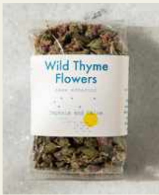
Wild Thyme Flowers THY20-PB